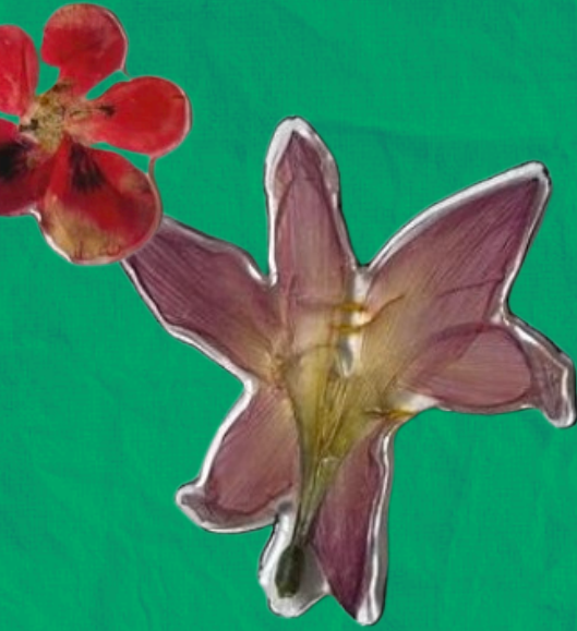
Flora & Fauna Resin-coated flowers