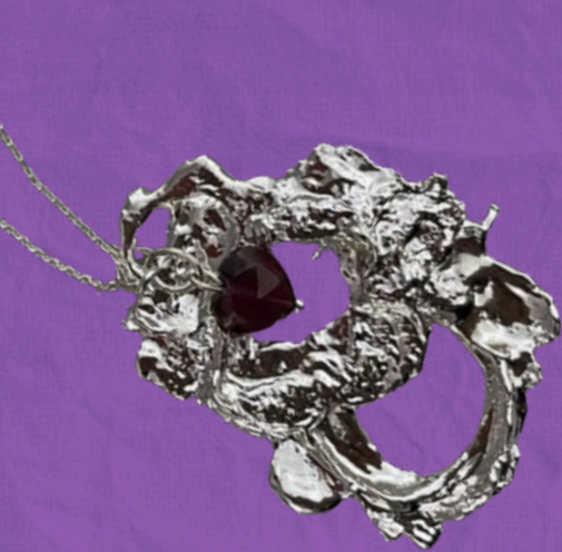
Molten Metal Asymmetric & Abstract Patterns