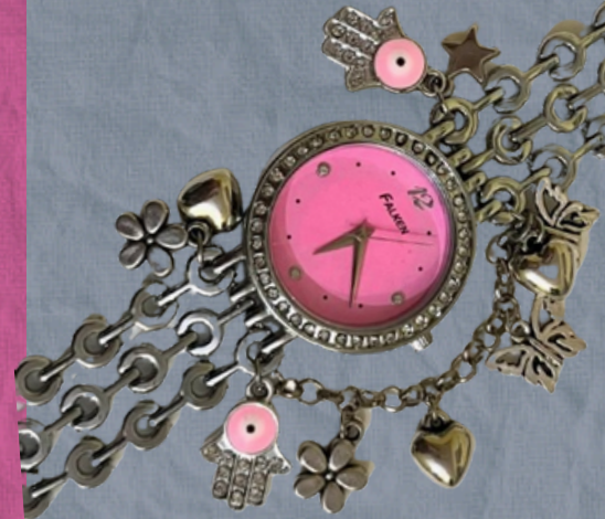
Tiny Trinkets Array of delicate charms