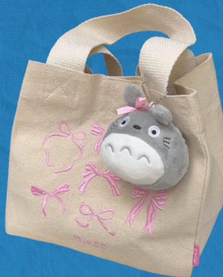
Pocket Pal Plushies & Personalised Keepsakes