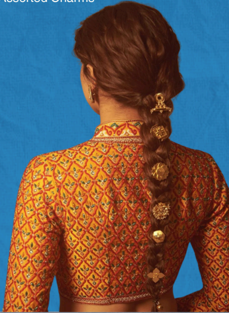
Chunks of Gold Evenly Dispersed Assorted Charms