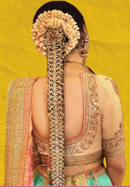
Golden Snake A Single Repetitive Pattern