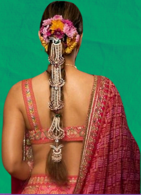
Bejewelled Waterfall Cascades of Jewels