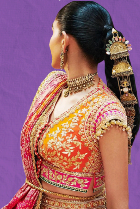
Divine Reminiscence Opulence borrowed from Heritage