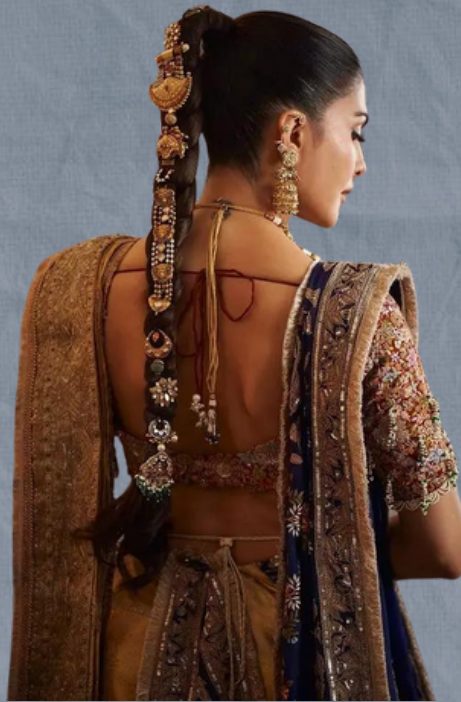
Cultural Mixtape Motifs with Multi-cultural Origins