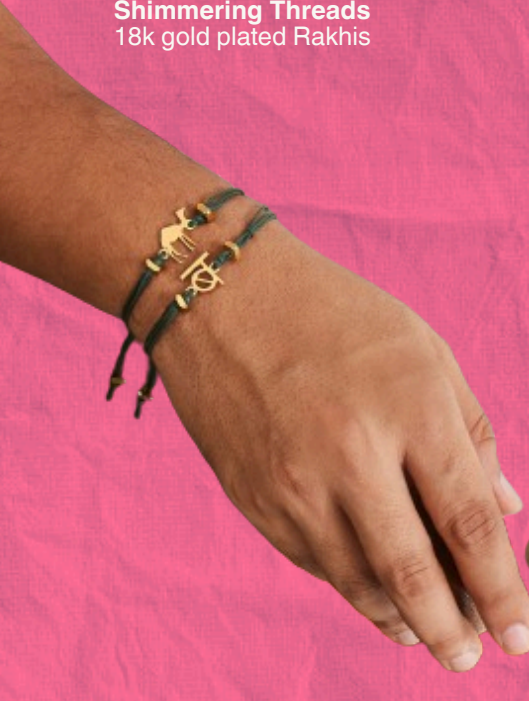
Shimmering Threads 18k gold plated Rakhis