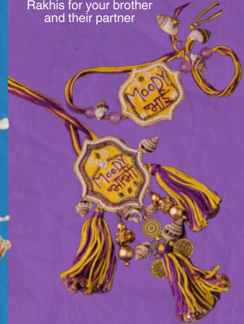
Tasseled Threads Rakhis for your brother and their partner