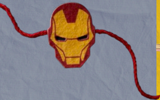
Planting Promises Rakhi that grows into basil