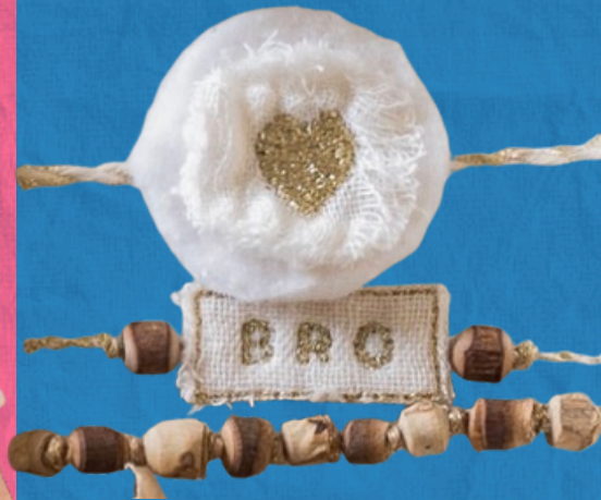
All Natural Hemp & Cotton Rakhis