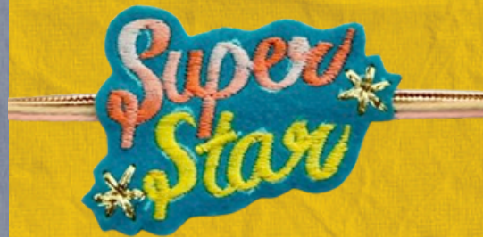
Transforming Trinket Magnetic Rakhis