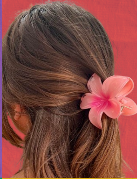
Coastal Chic Vacation inspired motifs