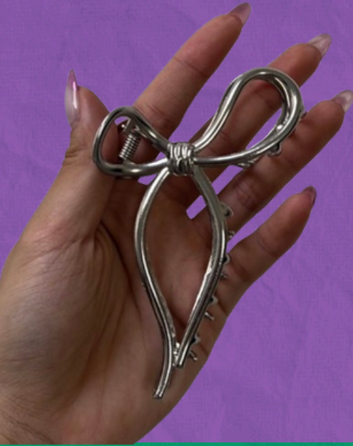
Big Bow Coquette Core inspired designs