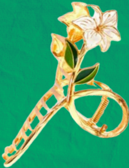
Floral Fantasy Botanical Themed