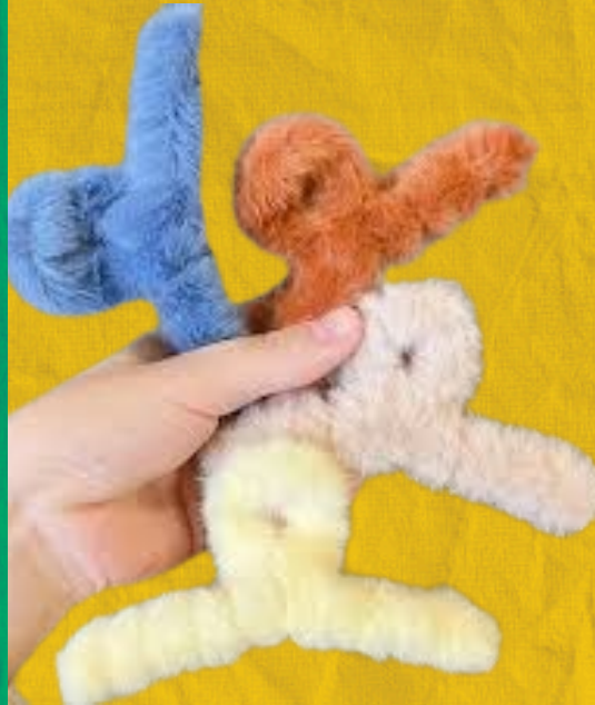
Plush Paradise Fuzzy Claw Clips