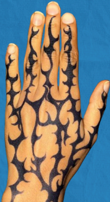
Digital mysticism Cyber Sigilism inspired Motifs