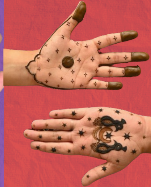
Galactic Elements Starry motifs