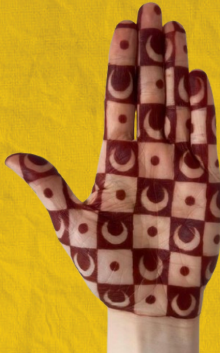
Checker board Checked Designs