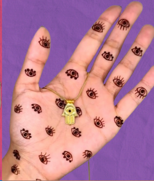
Tiny Buttas Small All-over Motifs