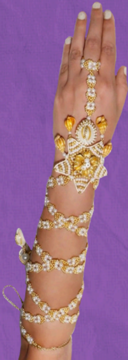
Heritage Harness State of the art designs