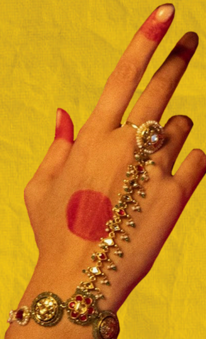
Charm au Classic Regal allure