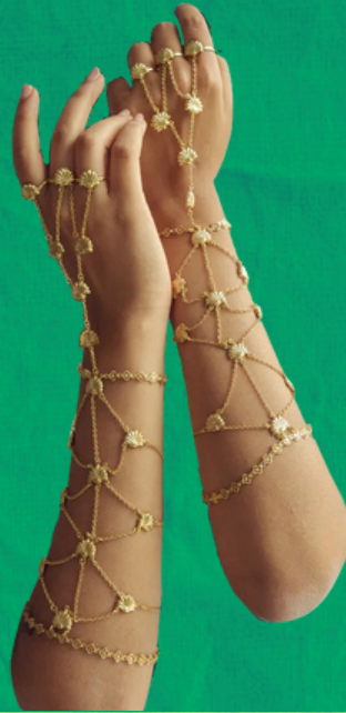
Golden Garlands Star studded gloves