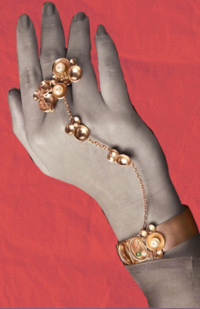
Modern Madhubala Glorious re-invention