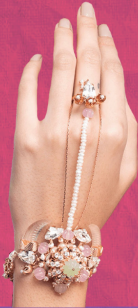
Pastel Paradise Contemporary twists