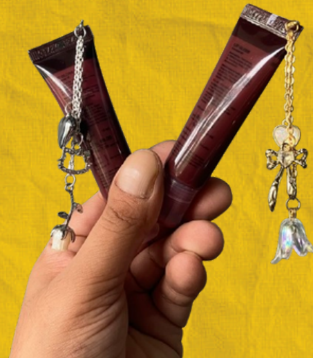
Whimsical Wonders Dainty, whimsy charms