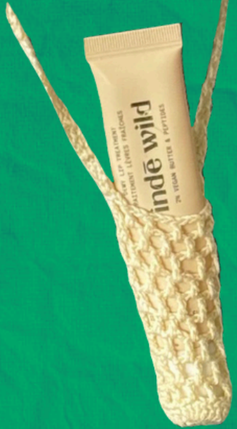
Crochet carry-ons Crocheted Pouch