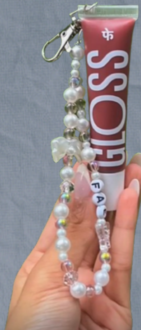
Beaded baubles Coquette-core inspired charms