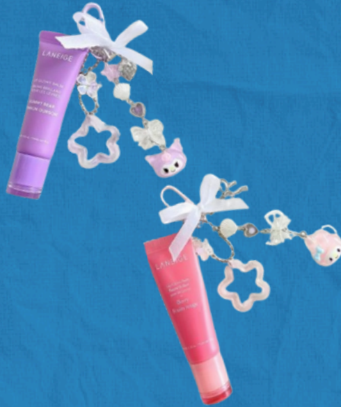
Mascot Magic Sanrio Characters