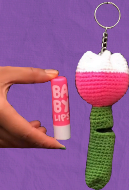
Flower Power Crocheted sleeve