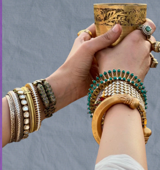
Heritage Regalia Timeless Bijou