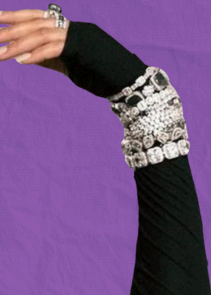
Diamond Dreams Rhinestone Galore