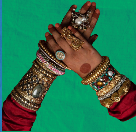
Magical Amalgamation Mix and Match