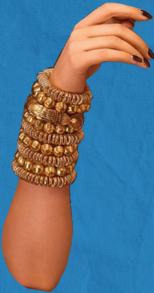
Golden Chariots Cascades of Gold