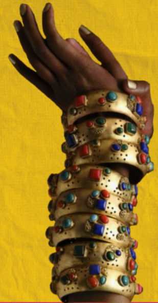
Re-imagined Glory Contemporary Origins