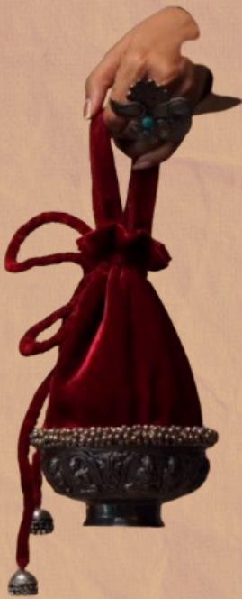
Velvet Potli With Oxidised Silver Accents