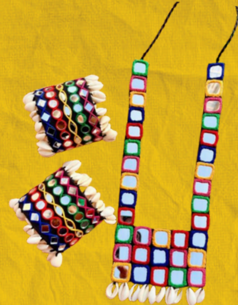
Kaleidoscope Colourful Mirrors and shells