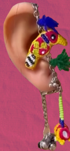
Panchi Ear Cuff Tassels and Ghunghroo