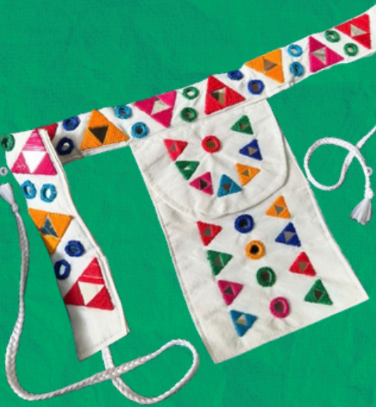
Functional Kamarband with Kutch Embroidery