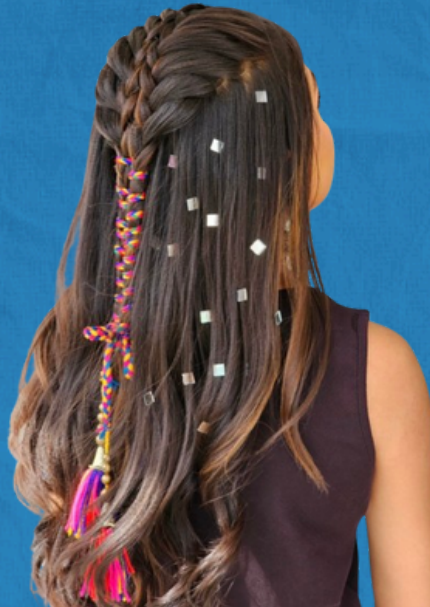
Boho Braid Tassels and Gota Patti