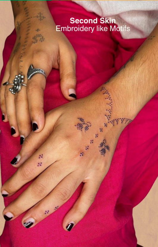
Second Skin Embroidery like Motifs