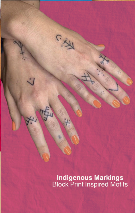
Indigenous Markings Block Print Inspired Motifs