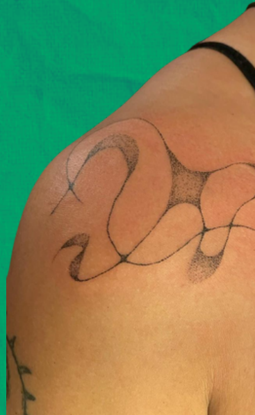
Abstract Lines Soft Grunge & Stippled Gradients