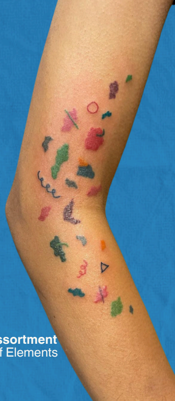
Playful Assortment A Collage of Elements