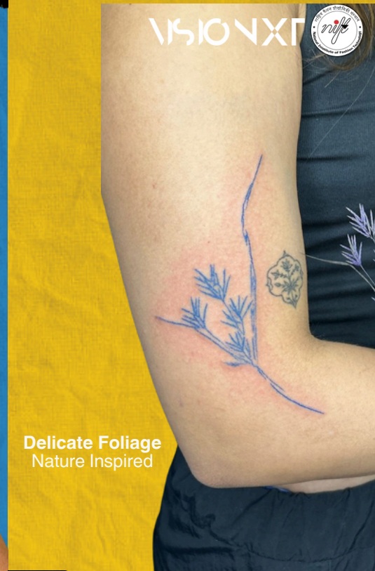
Delicate Foliage Nature Inspired