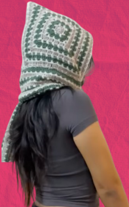
The "Scoodie" Hoodie + Scarf