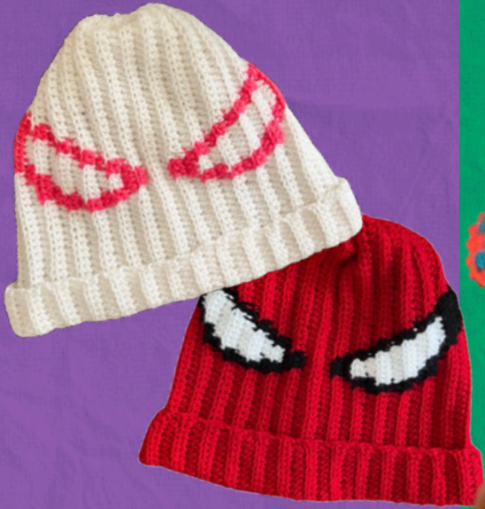
Beanie-verse The Spidey Couple