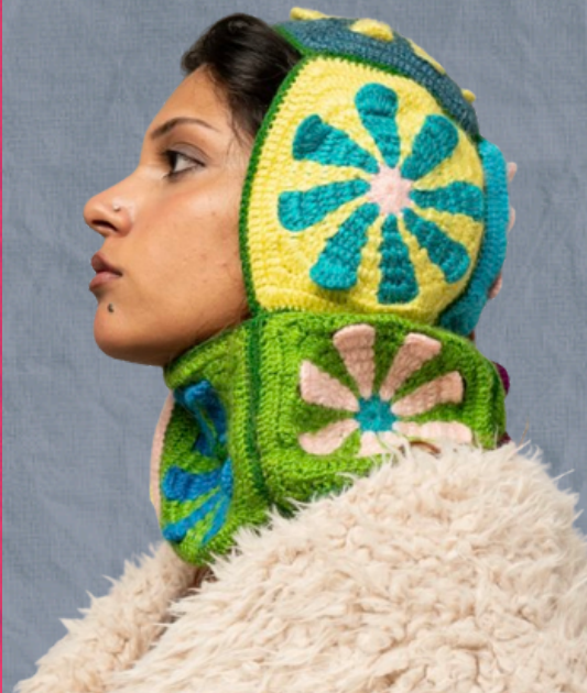
Buckled Kittens Balaclava with Floral elements