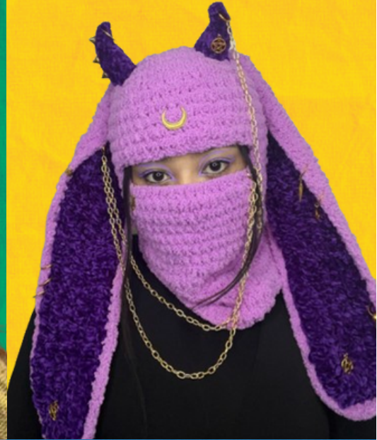
Ninja Bunny Balaclava with bunny ears