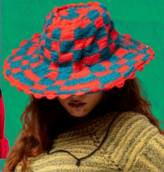
Yee-Haw Crocheted Cowboy Hat