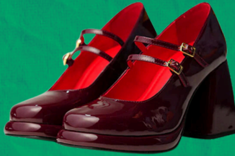
Goody Two Shoes Classic Mary Janes