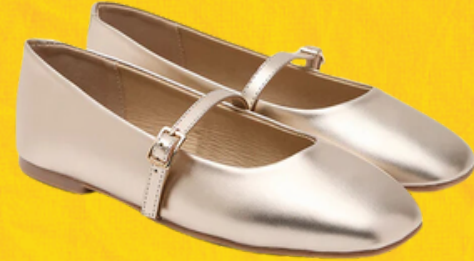
Dance of Metals Chromatic Ballerinas