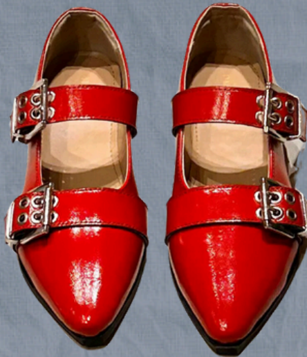
Buckled Kittens Bold Fastners