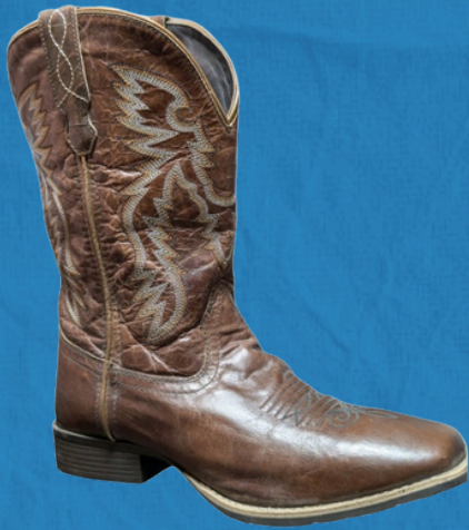
Howdy, you? Embroidered Cow Boy Boots