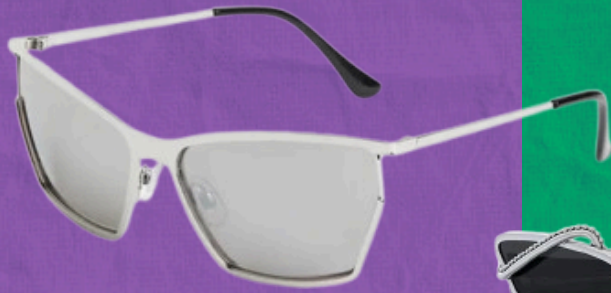
The IT Glasses Angular 'omph' addition