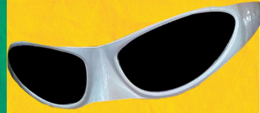
Ninja Gear Suave Ninja Core