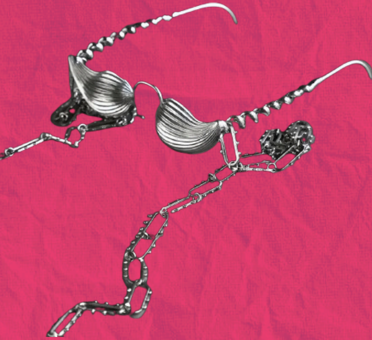
The "Showstopper" Heritage meets Future