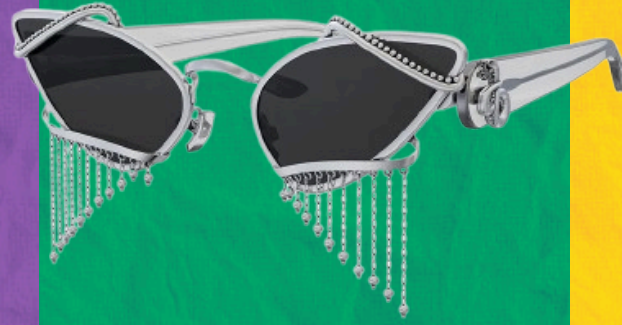
Drip or Drown Not your regular glasses