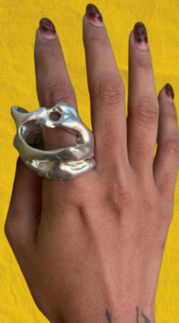
Wild Relic Molten and frozen