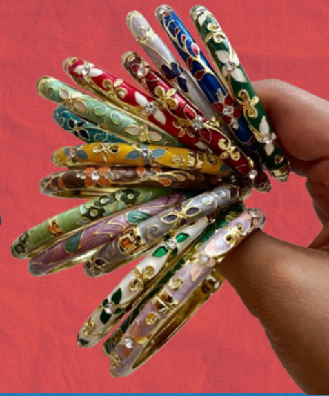
Enamel Reverie Tradition reimagined