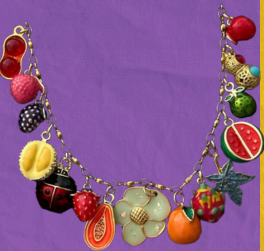
Tutti Frutti Juicy details