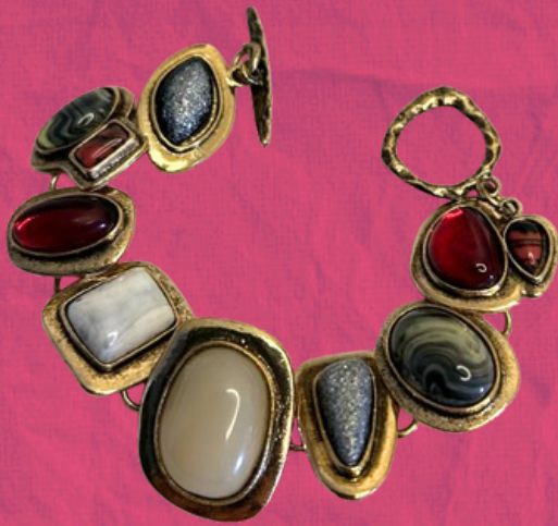
Mineral Muse Artful, earth-forged forms