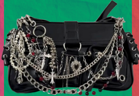
Chain Reaction Metallic overload