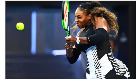
▣ 'Serena Williams is not the first elite athlete to compete during a pregnancy, but she is definitely the most prominent.'

The tennis star triumphed at the Australian Open without dropping a set while in her first trimester. Are women the weaker sex? I don't think so